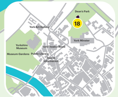
York city centre